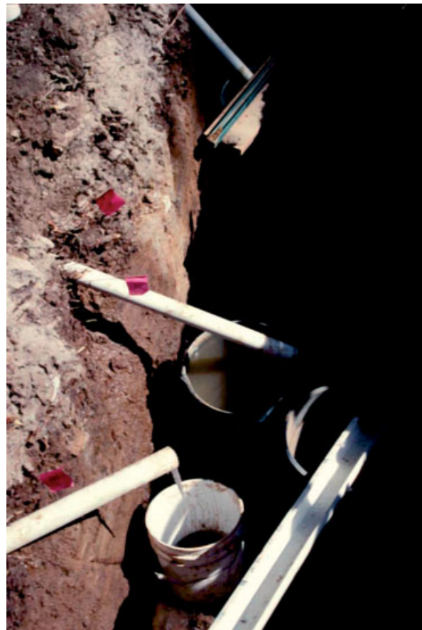
Figure 1. Trench face (left side of photograph) showing the site soil profile and macropore flow collection system. Note the mottled appearance of the trench-face soils that results from the heterogeneous water content distribution

Both soil wetting and flow were visually observed in the trench over an approximately 2 week period in March 1997. This is the only period when flow occurred in the trench, and despite our plans to collect additional data at the site, no lateral flow has